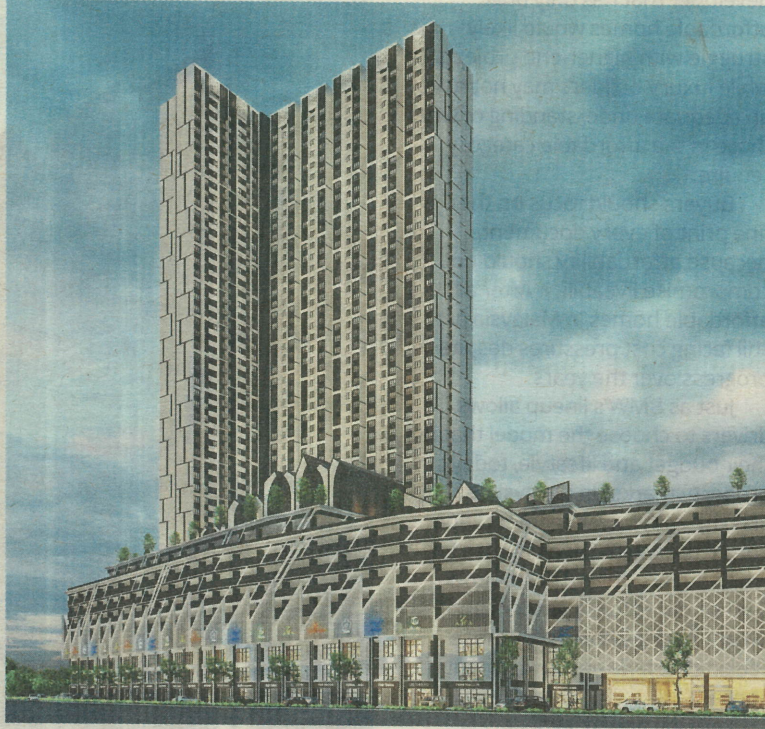
An artist impression of KSL Blossom Square.

KSL Blossom Square offers stylish homes and dynamic commercial spaces within one integrated address