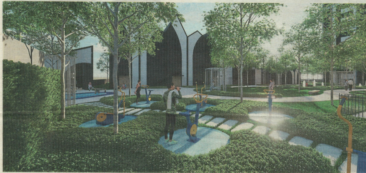
Unwind in style — a simulation of the Leisure Nook offers a cosy corner to relax, reflect or reconnect.

In the pipeline is the KSL Koji Business Park, a major 75-acre development in Ijok, Puncak Alam. Phase 1 comprises 54 units of three-storey semi-detached factories, each offering a spacious built-up of 6,607 sq ft. Priced from RM4mil, the project is expected to be completed in 2029.