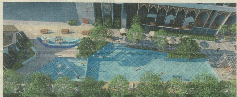
Experience modern lifestyle elevated — KSL Blossom Square's thoughtfully designed facilities bring community, wellness and convenience together.