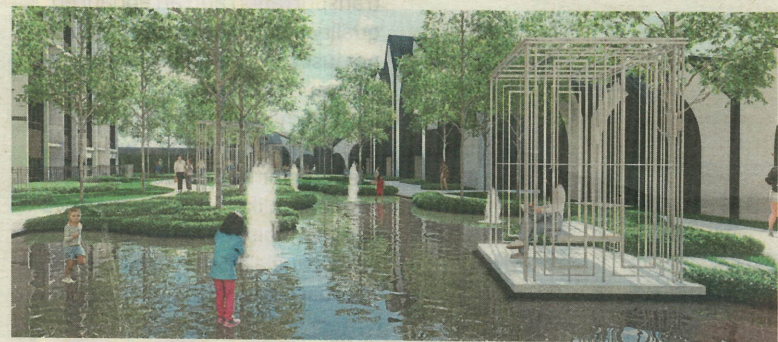
A tranquil water feature designed to soothe the senses — The Creek brings nature's rhythm into the heart of the community.