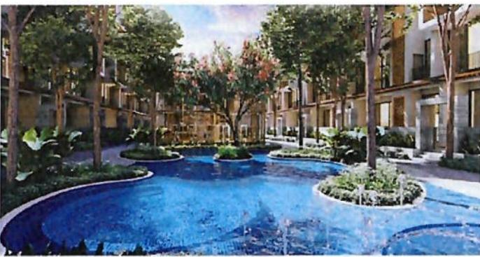
Jesselton Courtyard is a gated and guarded development located in the heart of Penang Island's most exclusive enclave

supported by a dedicated quality control department within our development team, while ensuring product functionality and sustainability.