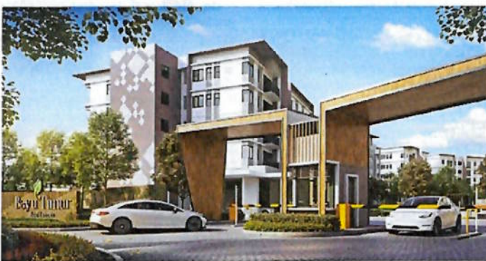
Bayu Timur Residences in Kota Kemuning offers resort style living combined with modern comfort