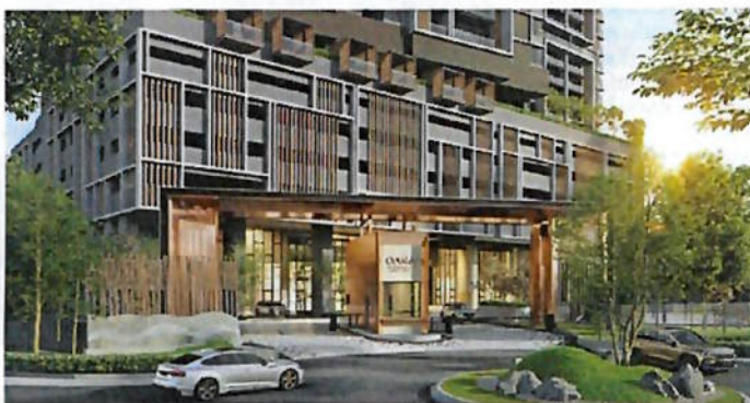
OAKA Residences in Bukit Jalil offers the perfect blend of tranquility and urban convenience